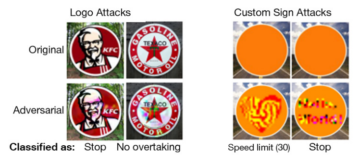
Figure 1: Shows the evasion attack on out-of-distribution examples for a traffic sign recognition ML pipeline, from Sevtlana et al.

Evasion attacks (Chakraborty et al., 2018) are the most prevalent in real-time situations such as attempts to evade the detection of malware and email spam. In an evasion attack, the attacker adds controlled perturbation to the data and manipulates the input data to deceive previously trained and deployed classifiers. During inferencing, the classifier misclassifies due to intended intrusion in the inference data. This attack degrades real-time predictions of the classifier although they are trained with legitimate training datasets.